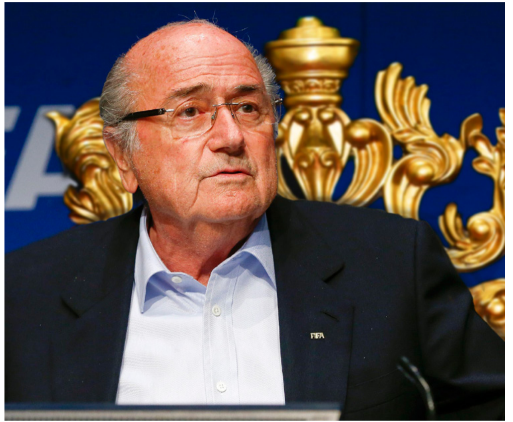
Sepp Blatter chaired the secret meeting in his office

Sepp Blatter: I'll talk to Abramovich, the Glazers and Murdoch. They told me they will not accept a Winter break. Now they have to stand up for the clubs